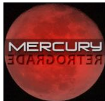
The third event of four this year is September 6-29