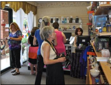
The Inspired Journeys store saw a lot of business at the Get Inspired Expo, June 27.

We are already planning next year's expo so if you weren't able to make this one, mark it on your calendars for the end of June next year! ✧