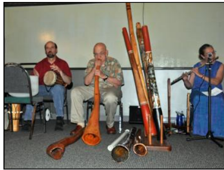
The Didge Brothers new age ensemble provided sound energy healing at the Get Inspired Expo.